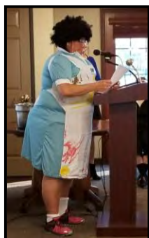
Big Mama's Kitchen