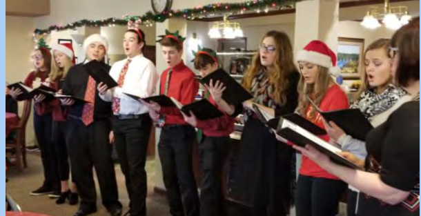
Hemptead High School Penn Ave Singers

Thank you to everyone who shared their gift of music with us this holiday season. Pictured below are a few of the groups that visited Sunset Park Place in December.