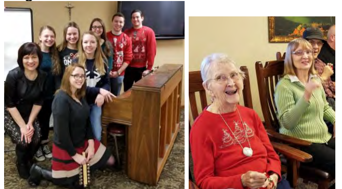
Hemptead High School