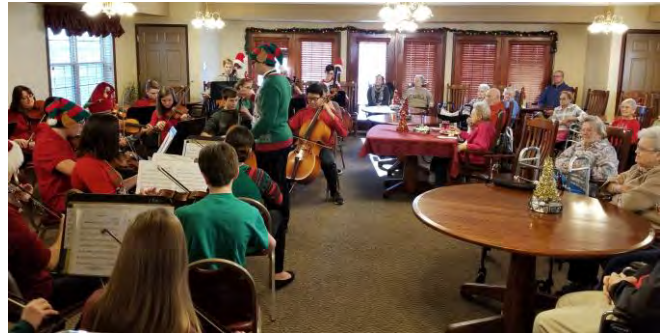
Eleanor Roosevelt Middle School Orchestra