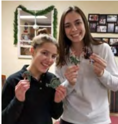
Whalert High School Art Club made Christmas Ornaments for the residents.