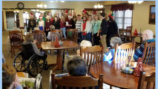
Western Dubuque High School Vocal Music